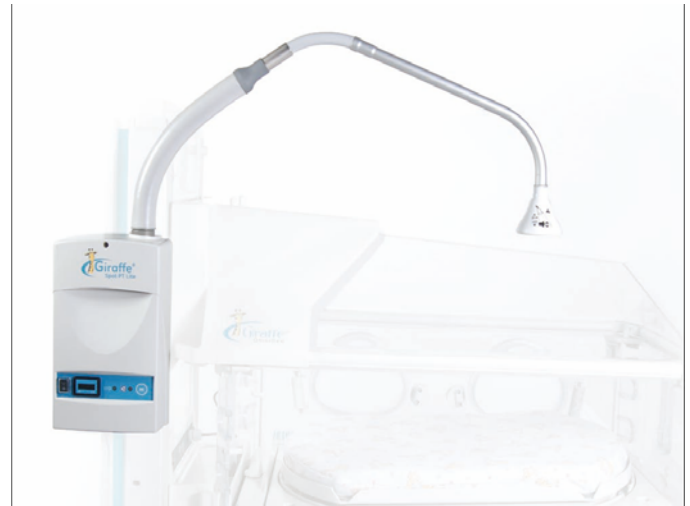
Figure 2: Phototherapy Light.