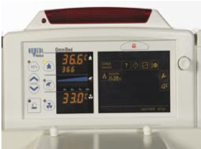
Figure 1: Boost Air Curtain on Display.